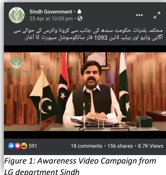
Figure 1: Awareness Video Campaign from LG department Sindh

different medium of communication according to local needs and environment. LG & CD Punjab used auto-rickshaw carrying messages 'stay home stay safe'. Sindh Local Government Minister have started an awareness message campaign through Social Media.