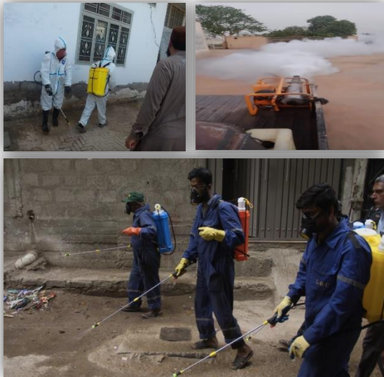
Figure 4: Disinfection Spray in local areas of Baluchistan

Increased sanitization across the provinces, in fact, the biggest cleanliness drive in the history of the country has undertaken by the provincial local government departments. Such as the disinfection spray in local areas of Baluchistan.