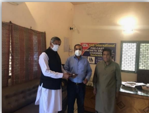
Figure 5: Donation of Corona testing kits in Kasur, Punjab

of Sindh provides 1 million soap bar for people to wash their hands. The union councils are authorized to purchase up to Rs 100,000 soap bars for distribution to the people of that union council.