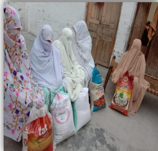
Figure 9: LCA-KP executive committee member and ex-district councillors 15 days ration in Mardan villages