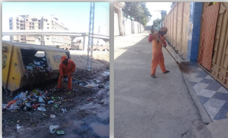
Figure 3: LGs of PK are playing indirect role in health protection through waste management and enhancement of sanitization.

Health is the federal and provincial jurisdiction in Pakistan 3 and LG playing an indirect role in health protection. LG is responsible for the collection of household waste and enhanced sanitization of public spaces across the country (but primarily in urban areas)