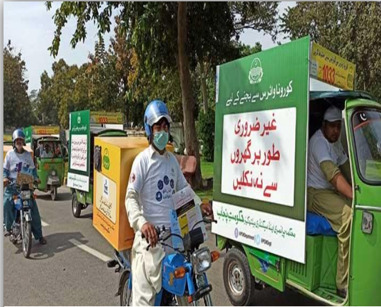
Figure 2: Riksha Awareness Campaign in Punjab

In local languages. Local Government Sindh issued an awareness-raising video informing people about the pandemic and how to protect themselves. The awareness videos is an Urdu song, which urges the people to support each other in these hard times, keep the social distance for the time being and stay at home as much possible to stop the spread the Covid-19 virus. The video is trying to spread optimism among in public 2 . In