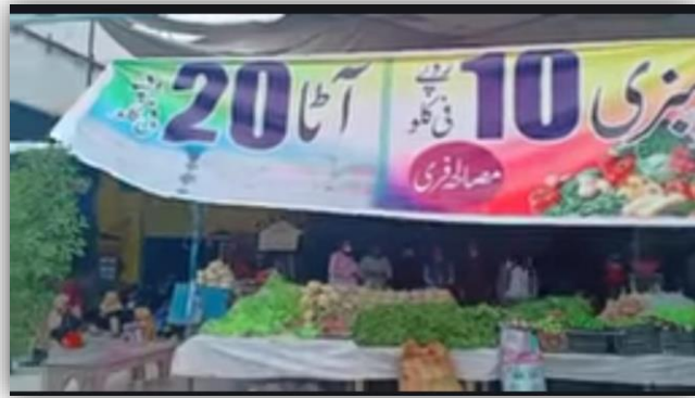
Figure 8: Food & vegetables at low price in market by LCA Punjab members

Some examples of actions at the community level include: Farzana Abbas, former Municipal Corporation Sahiwal, Ome-Kulsom former MC member from Muzaffargarh, councilor and member LCAP worked to raise awareness in District Sahiwal on health protection and how to stop the